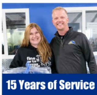
15 Years of Service