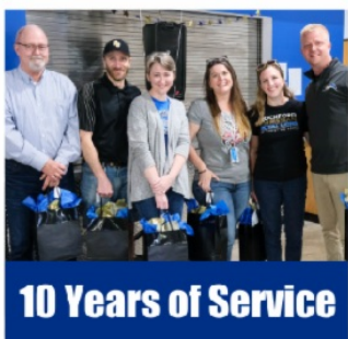
10 Years of Service