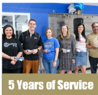
5 Years of Service