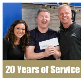
20 Years of Service