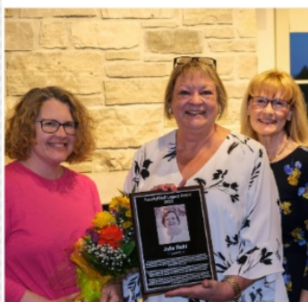
Julie Rohl Legacy Award ~ Faculty

Congratulations to our 2023 retirees and Legacy Award recipients! Thank you for your commitment to Christian education at Rockford Christian. Once a Royal Lion, always a Royal Lion!